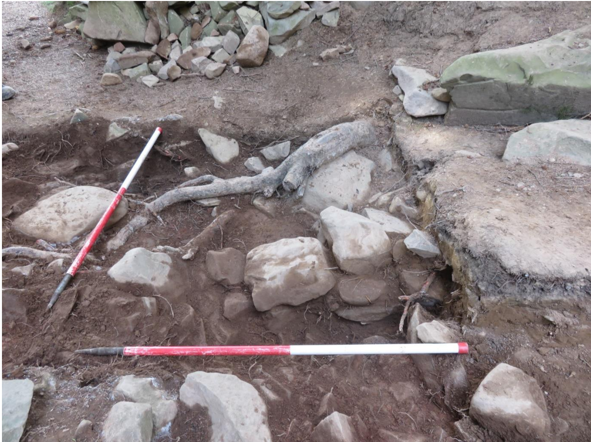
The footings of the earlier wall to the west of the peel house extension.

An earlier building was found to the west of the extension to the peel house which pre-dates it and possibly the peel house too, suggesting it could be late medieval in date. However, only one corner of the building was available to excavate due to the presence of trees ( see photograph ).