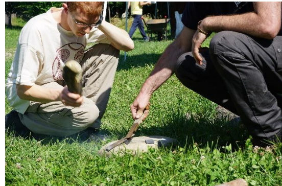
Breaking up a replica bronze sword using an antler hammer

single group. It was as if the objects had been bent or crushed on the nearby rock outcrop then thrown into the bog.