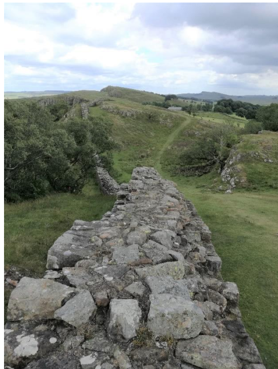
Section of Hadrian's Wall at Carvoran looking west