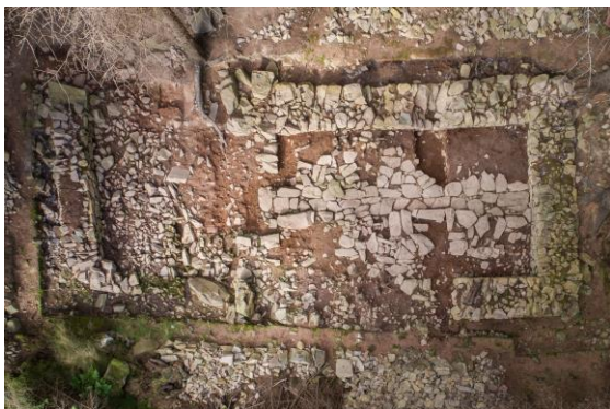
Peel house, Shootinglee

An additional exploratory trench was opened about five metres west of the peel house to examine a possible building platform. A paved floor was found in the south end of the trench with a possible wall on its south side. To the south of this there was a gravel yard surface east of a rubble base for a wall that may be the robbed remains of the yard wall visible immediately south of the trench.