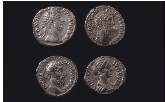
Roman silver denarii from the cache of nearly 300 coins found at Edston Quarry in 1994 and now in Tweeddale Museum.