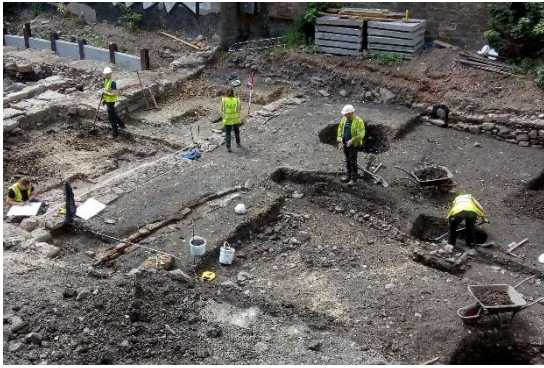
View of excavations at the India Buildings site

The recent excavations, with up to 5 metres of deposits, have fulfilled expectations. Nick described how the wet site has preserved timber structures pre-dating the formal foundation of Edinburgh. A series of ditches, believed to be the original burgh boundary, have been found. With samples of wattle and daub, large beams and post holes there is a lot to unravel among the multiple levels of hearth, floors and stone cobbled yards. A remnant boundary wall of about the 15th century perhaps relates to the King's Wall. Alongside the wall are highly developed burgage plots, linked to the properties in the high street. Above these remains is an unbroken sequence of urban development through to the 19th century.