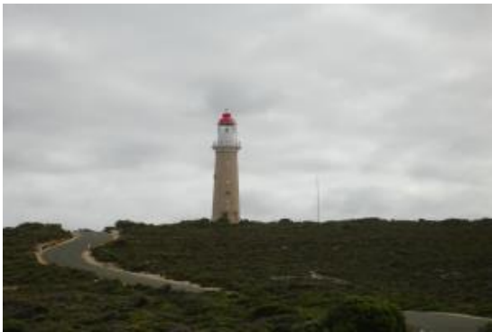
Cap du Couedic, on Kangaroo Island, South Australia

Positioning in space and navigation by a chosen route, depends on timing. A quick run through of what we understand of time as presented by Isaac Newton, Albert Einstein, Stephen Hawkins and even Douglas Adams got us warmed up, followed by some examples of fine navigators like the South Sea Islanders and Desert Nomads. Transhumance agriculturalists rely on timing and navigation to move flocks, sometimes over hostile terrain.