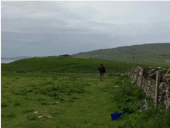
In the middle distance, the remains of Cubbie Roo's castle, Wyre, Orkney

buildings of the time confirmed that this was how the powerful families chose to build. But there are also simple square towers, like Cubbie Roo's castle, stone-built, and possibly serving as administrative centres, as they were often on the coast or small islands and not on the good agricultural ground.