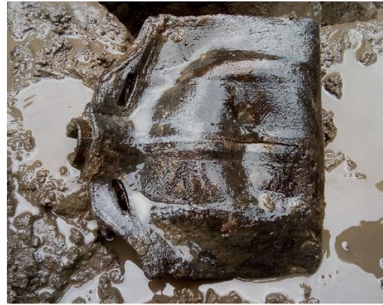
Complete leather canteen or 'costrel' found in the waterlogged fill of a well

Each of the many phases has produced a wealth of finds, most yet to be conserved and interpreted. For example, one stone-lined well produced numerous finds of animal bone and hair, metalworking waste, ceramic fragments and leather fragments, including a well preserved and unusual medieval drinking vessel known as a 'costrel'.