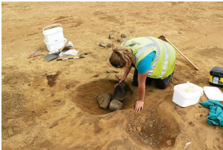
Excavation of pit containing Neolithic pottery

Some of the discoveries have raised more questions than they answer about what we thought we knew about the region.