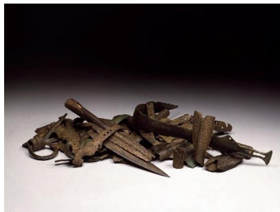
Hoard of Late Bronze Age weaponry mainly comprising fragments of deliberately broken up swords and spearheads, dredged from Duddingston Loch, Edinburgh in the 18 th century