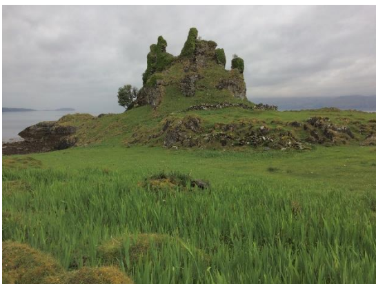
Castle Coeffin, Lismore, Argyll